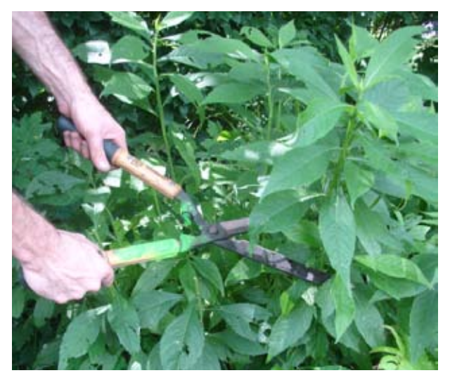
Taller, late-summer blooming perennials and grasses may be sheared back by 40-60% in late May to control height and prevent flopping.