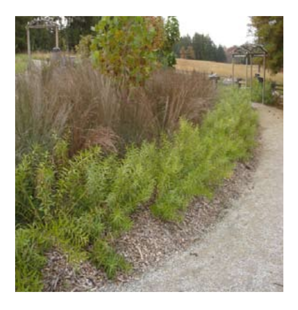
Shining bluestar (Amsonia illustris) hedge along walkway.