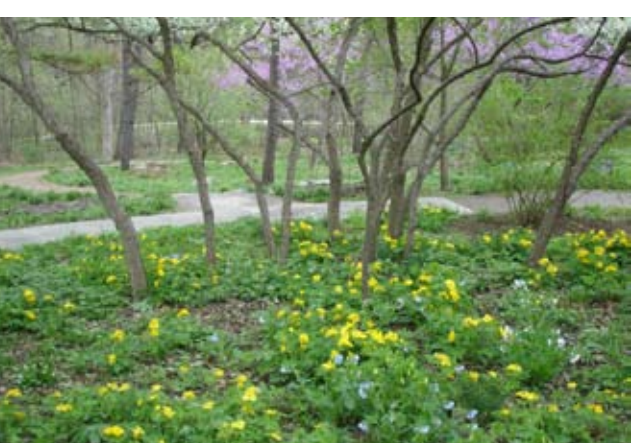
Wood poppy (Stylophorum diphyllum) and Virginia bluebell (Mertensia virginica) spread from seed in the Whitmire Wildflower Garden.

Viola pubescens (yellow violet) Viola sororia (common violet) Viola striata (cream violet)