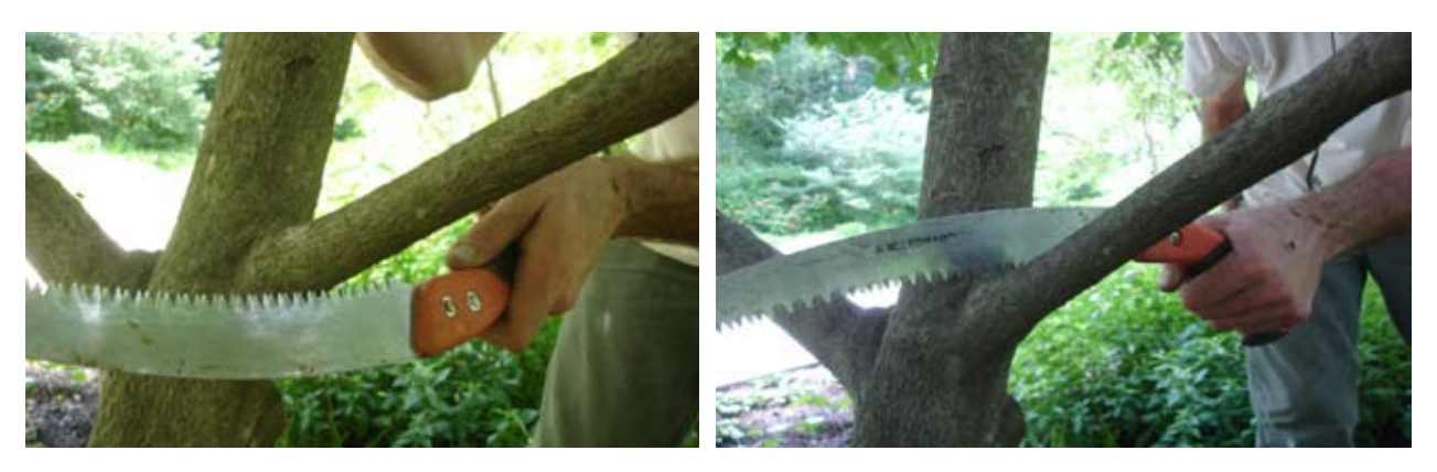
When pruning medium-sized branches, always make a small undercut first (left) and then finish the cut with an overcut (right). This prevents the bark from tearing downward when the branch falls.

garden phlox, goldenrod, and ironweed. The grasses include big bluestem, Indian grass, switchgrass, cordgrass, and eastern gama grass.