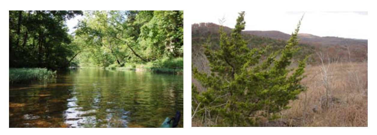
A typical Missouri creek in the Ozarks (left) and rocky glade (right) are homes to many native plants that are useful in native landscaping.

prairies, wetlands, river-bottom forests, glades and upland savannas. They have evolved with the extremes of our climate, a wide array of pathogens and a variety of soil and moisture types, creating a palette of durable and showy Missouri native plants that are the focus of landscape gardening. Plants such as yellow wild indigo (Baptisia sphaerocarpa), native to the tallgrass prairie, and whitetinged oak sedge (Carex albicans), which grows in dry woodlands, are easy-to-grow beauties being showcased in botanical garden displays, Metro St. Louis Sewer District rain gardens, and homeowners' flower beds. Gardeners who use Missouri native plants have more success than those who use plants from other regions of the United States.