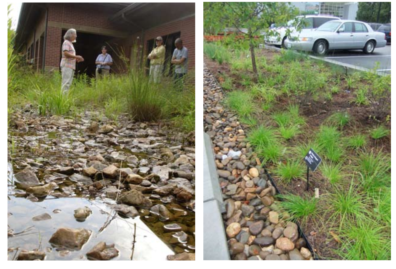
The proper handling of stormwater runoff is a significant issue for homeowners, neighborhoods and communities. Left: a rain garden planted with Missouri native plants at the Missouri Methodist Conference Center in Columbia, Missouri. Right: Missouri Botanical Garden bioretention best managment practice (BMP) planted with natives in the main entry parking lot (oak sedge (Carex albicans) in foreground).