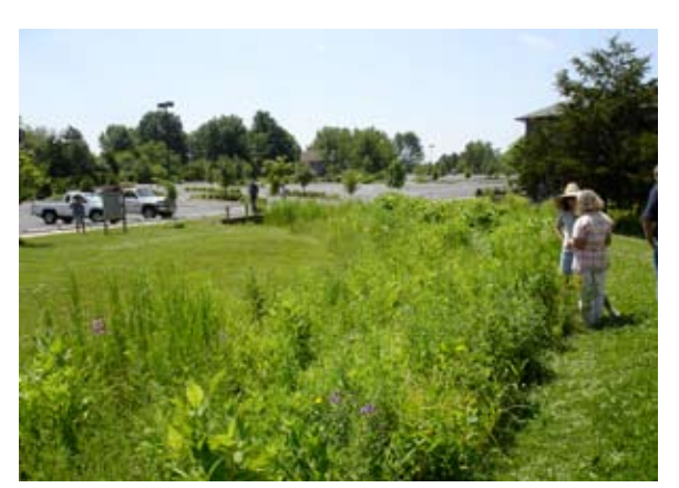
Bioretention seeding in Columbia, Missouri reduces maintenance costs associated with mowing, mulching, and weeding.