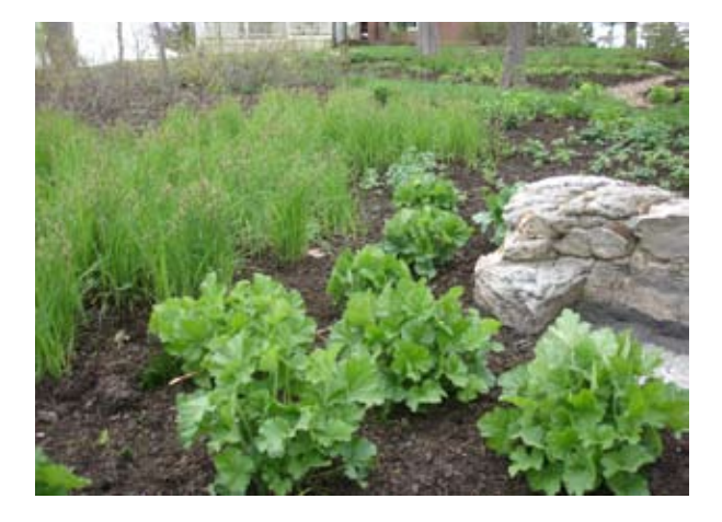
Low-maintenance native groundcovers are used in simple massed plantings. When fully mature they suppress weeds and reduce the amount of mulch needed. Left: yellow fox sedge (Carex annectans) Right: prairie alumroot (Heuchera richardsonii)