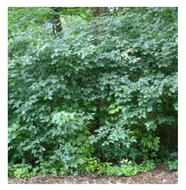
Bladdernut (Staphylea trifoliata) forms a dense screen with dark green leaves and lime-green seed pods in summer.

Ilex decidua (possum haw) Juniperus virginiana (eastern red cedar) Physocarpus opulifolius (ninebark) Ptelea trifoliata (wafer ash)