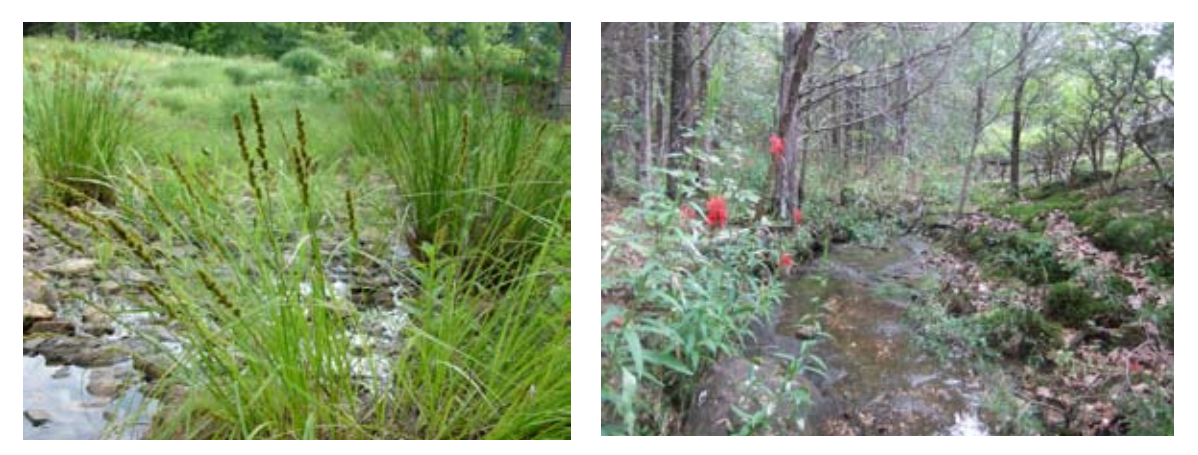
Plants growing in nature give us clues as to where they may be suited in a man-made landscape like a rain garden. Left is yellow-fruited fox sedge growing in a sunny creek bottom. Right is cardinal flower growing at the edge of a shady creek.

that tolerate low fertility and poor drainage.