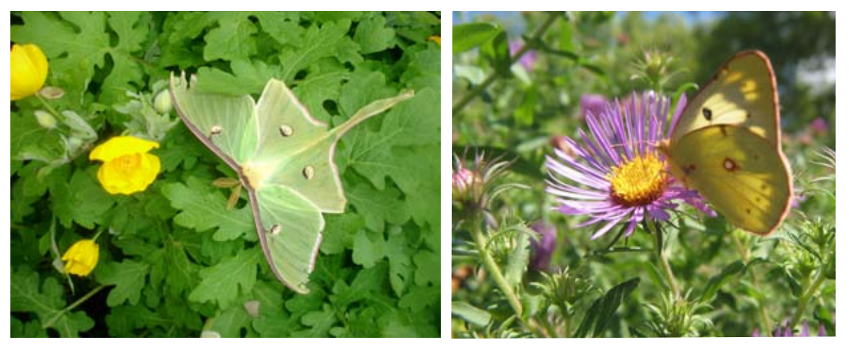
Left: Luna moth perched on wood poppy. Right: Sulphur butterfly getting nectar from a New England aster blossom.

Native plant gardens present endless opportunities for learning about seasonal cycles, wildlife, and plant life cycles. Quiet spaces outside can be used for art and reading classes. Environmental and conservation topics are taught best outdoors.